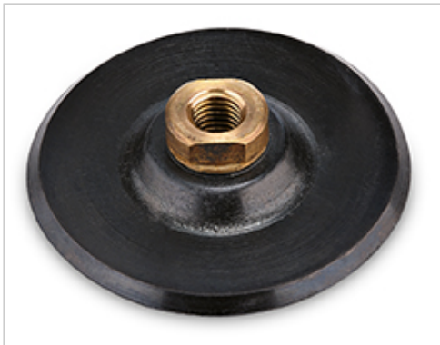
For secure attachment of the velcro diamond discs. M 14 connection.