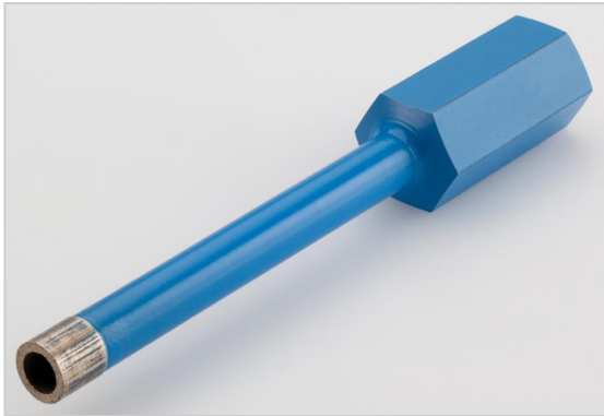
M 14, wet, for natural stone and fine stoneware tiles.